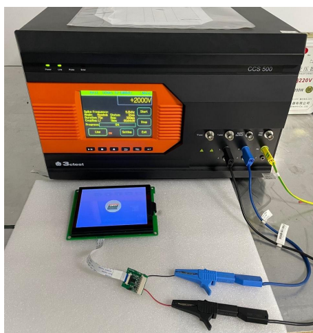
3.2 群脉冲测试图 EFT test